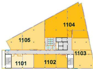
11 th floor