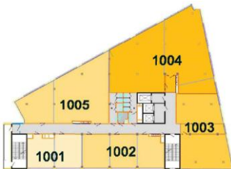
10 th floor