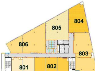
8 th floor