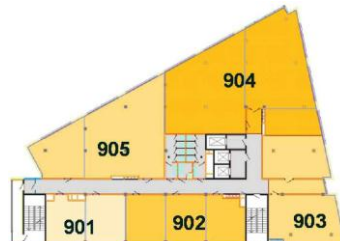
9 th floor