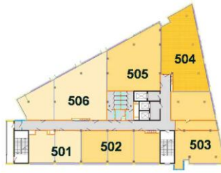
5 th floor