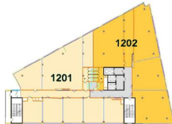
12 th floor