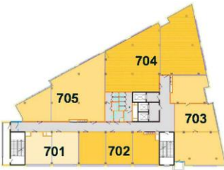
7 th floor