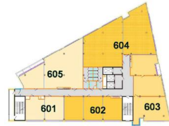
6 th floor